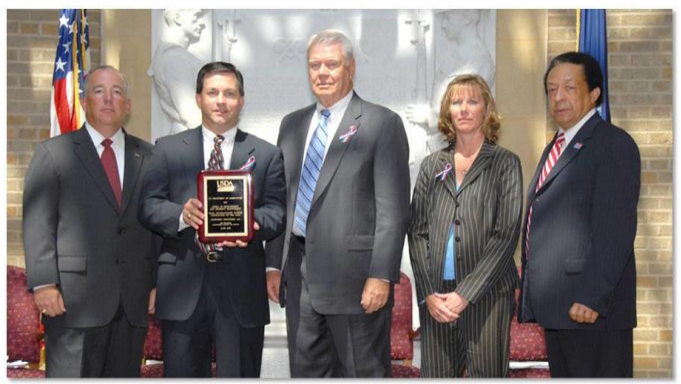
Anadarko Industries was selected as the Small Disadvantaged Business of the Year by the USDA

Our strategy for success is to excel as a value-added partner to government agencies, large prime contractors and small businesses providing government support services.