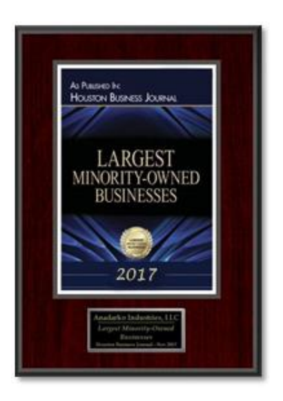
Anadarko Industries was selected as the Eighteenth (11<sup>th</sup>) Largest Minority-Owned Business in the Houston Area