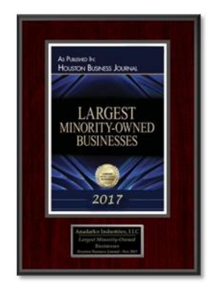
Anadarko Industries was selected as the Eighteenth (11<sup>th</sup>) Largest Minority-Owned Business in the Houston Area